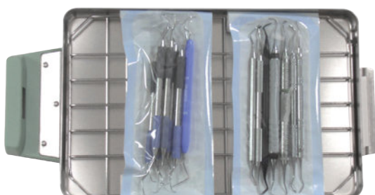
Loading Sample 4 - Wrapped

Two sets of instruments (14 Instruments) wrapped