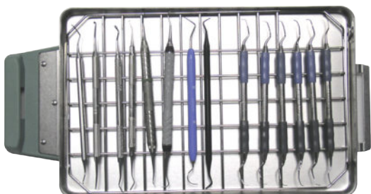
Loading Sample 3 - Unwrapped