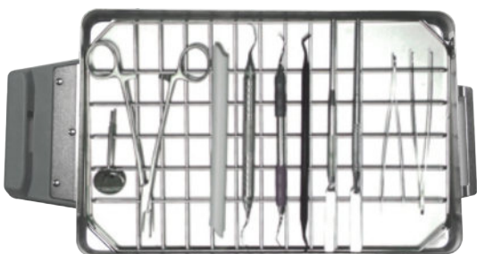
Loading Sample 2 - Unwrapped