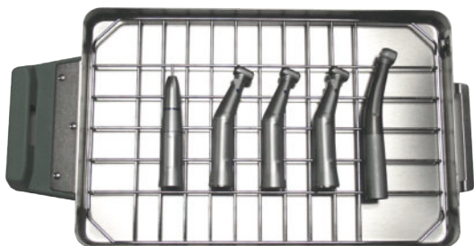
Loading Sample 1 - Unwrapped